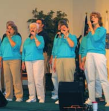
Bay Singers entertain residents, Doig Chapel, on Saturday, August 16th.

For a Business Class learning project, Alma College students taught Masonic Pathways residents the art of playing Wii. Bowling and tennis were included in the Sports residents could take on. AC students held three classes a week, and ended their project with a big Masonic Pathways Wii tournament.